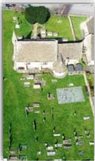
St George's Semington