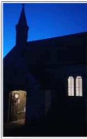
St Mary the Virgin, Whaddon