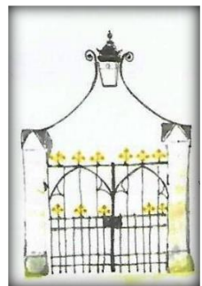
Painting by Gill Guymer

As the churchyard is 'closed' it is managed and maintained by Wiltshire Council including grass cutting, tree felling and gate repainting.